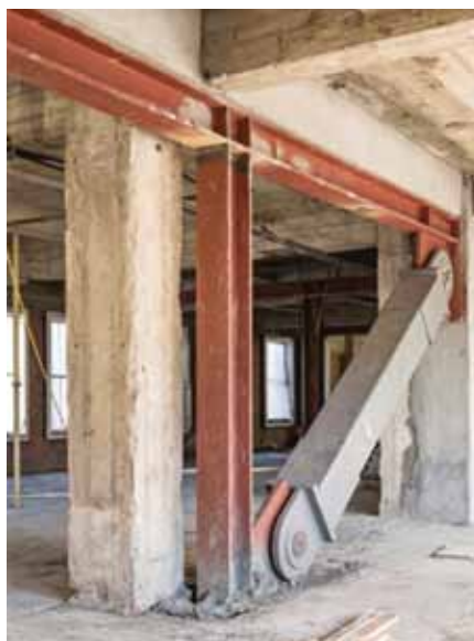
Figure 7. BRB at outrigger truss.

Based on the evaluation of a number of schemes with respect to the previously discussed selection criteria, a strengthening scheme utilizing new reinforced concrete core walls with structural steel outrigger trusses was chosen. Other considered schemes included propped steel-plate shear walls, internal steel-braced frames with buckling restrained braces (BRBs), and perimeter shotcrete overlay walls. The proposed scheme had the smallest impact on the existing building, was the most