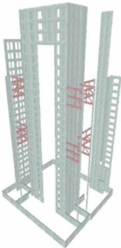
Figure 9. New seismic lateral resisting system.

Figure 9 illustrates the new seismic load-resisting system as implemented in the analytical model.