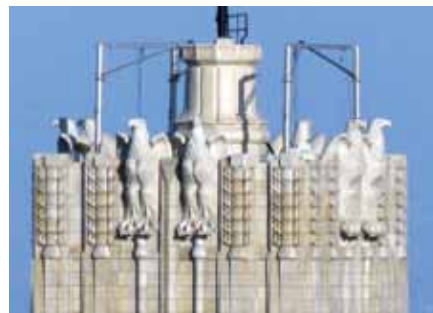
Figure 3. Eight terracotta eagles perched atop the 140 NM.

An article in San Francisco Newsweek from 1925 described 140NM as “the new building generation, a monument to western progress, and foresight.” Eight decades later, a new developer was determined to continue this vision and honor its original inception as a modern communication hub and a center of innovation. 140NM was going to continue housing the technology of tomorrow by attracting creative entrepreneurs and