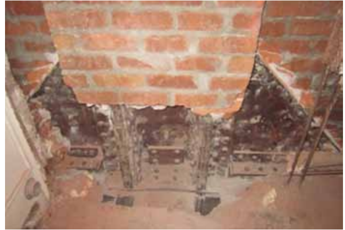
Figure 6. Typical existing wind brace moment-resisting connections.

The majority of the windows were replaced with high-performance glazing and will remain operable to promote natural ventilation. Some exterior restoration of the historic terracotta and historic glazed brick façade was undertaken, which included repointing of joints and patching/repainting individual units as necessary.