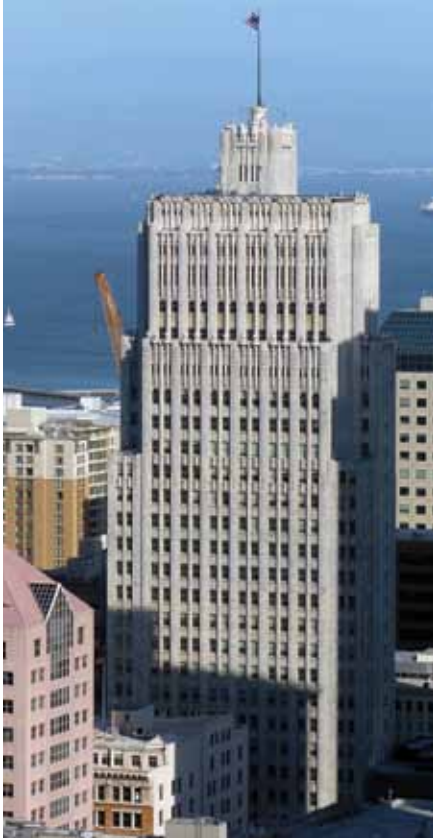
Figure 1. 140 New Montgomery, San Francisco.

(see Figures 2 and 3). The entrance houses an ornate and dramatic lobby with detailed bronze doors, marble walls, and a hand-painted plaster ceiling by Mark Goodman (see Figure 4). The entrance also leads to a marble staircase.