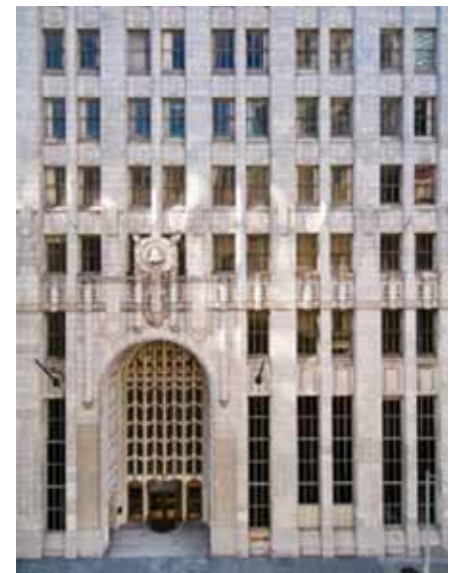
Figure 4. Historic Lobby Entrance.

Some of the major work undertaken in this renovation includes the historic lobby rehabilitation, elevator modernization (to support destination control), and entirely new mechanical, electrical, and plumbing systems designed with tenant controllability.