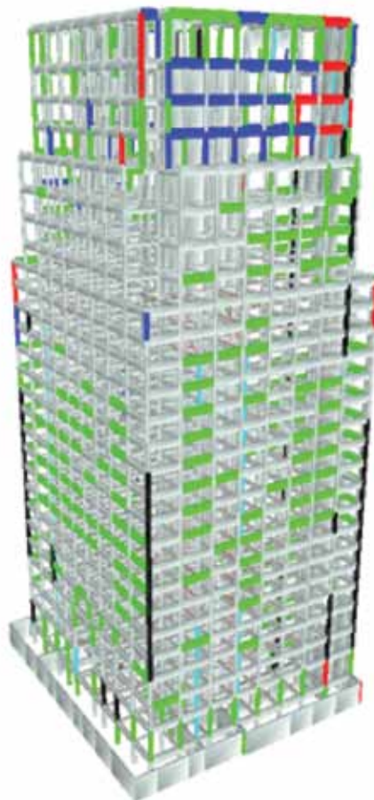
Figure 10. Combined model