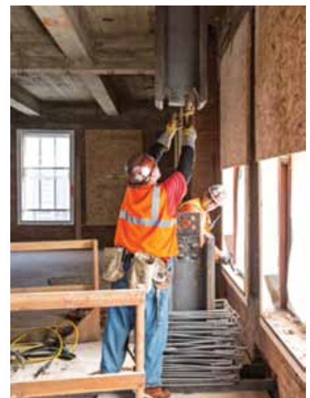
Figure 8. Supercolumn installation.

The core walls were stiffened with the two-story deep outrigger trusses located below Levels 8 and 19. They were located as high as practicable in the building without adversely impacting the usable floor space, as the building façade steps at Level 19. The