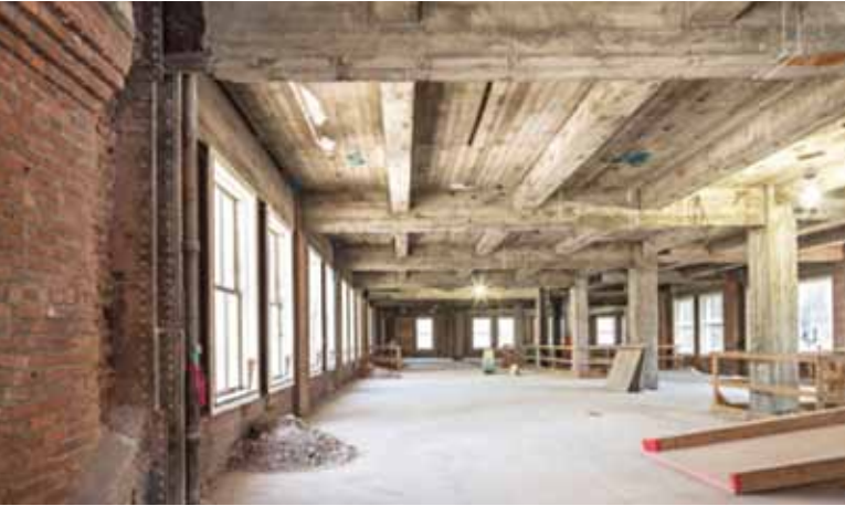
Figure 5. Typical interior floor after soft demolition.