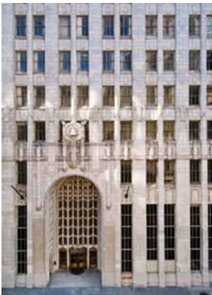
Figure 2. Terracotta façade along New Montgomery Street.

Since completion, the building has remained relatively untouched, with a façade renovation in the 1980s and parapet bracing installed just prior to the 1989 Loma Prieta earthquake. Comparing the building then to