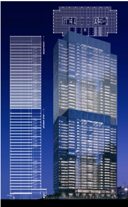
Figures 3/4. Blue Cross BlueShield of Illinois Headquarters, Chicago, Illinois, USA, 1997/2010

Client: Health Care Service Corporation Architect: Goettsch Partners