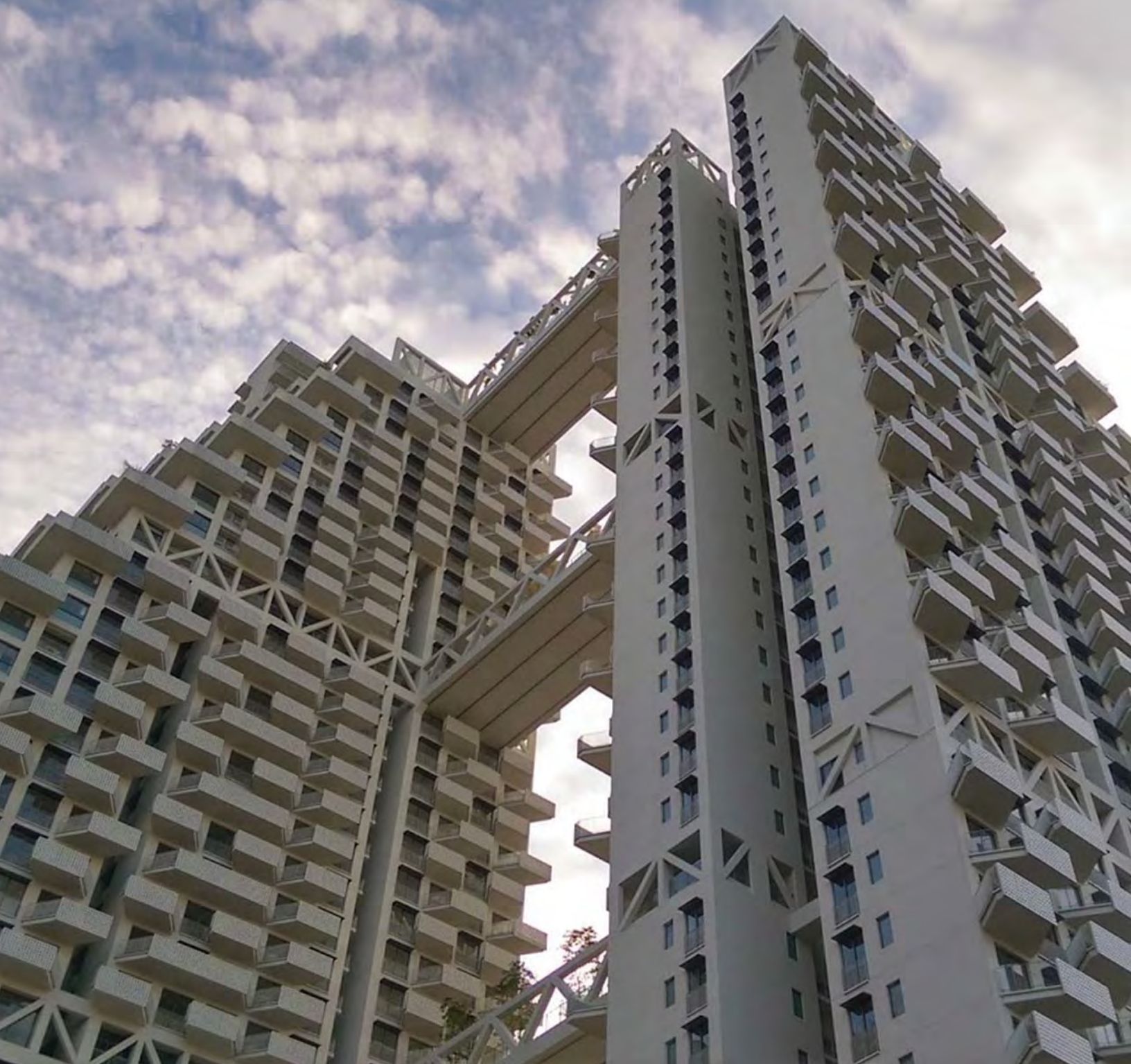
Figure 2. Sky Habitat, Singapore.

exploding urban densities throughout the world. A recently completed high-rise residential tower project in Singapore provides the opportunity to test the principles of Habitat in a new light (see Figure 2).