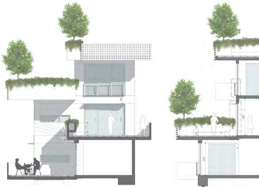
Figure 11. Balcony details.

each balcony is a custom railing screen, which serves to further shade the structure. The screen is constructed as an aluminum egg-crate, providing privacy while allowing air to flow through. The balconies shift left and right, one atop the next, which gives each homeowner a double-height balcony space (see Figure 11). As a byproduct of the shifting balconies, the entire façade becomes pixilated, further breaking down the scale. All other openings without balconies have Juliet-style railings, so that homeowners can open the unit entirely to the exterior, to be cool and airy.