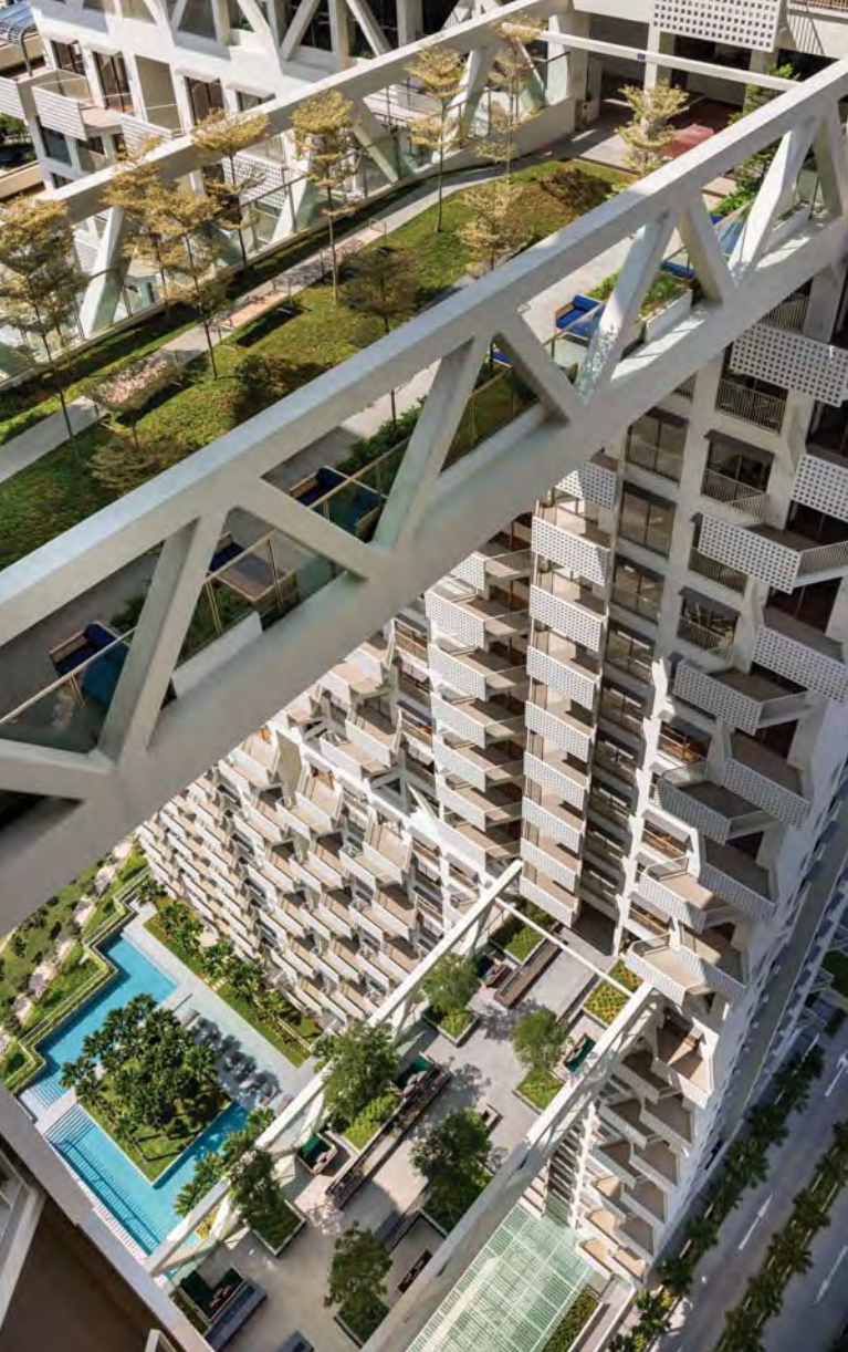
Figure 6. Landscaped skybridge.