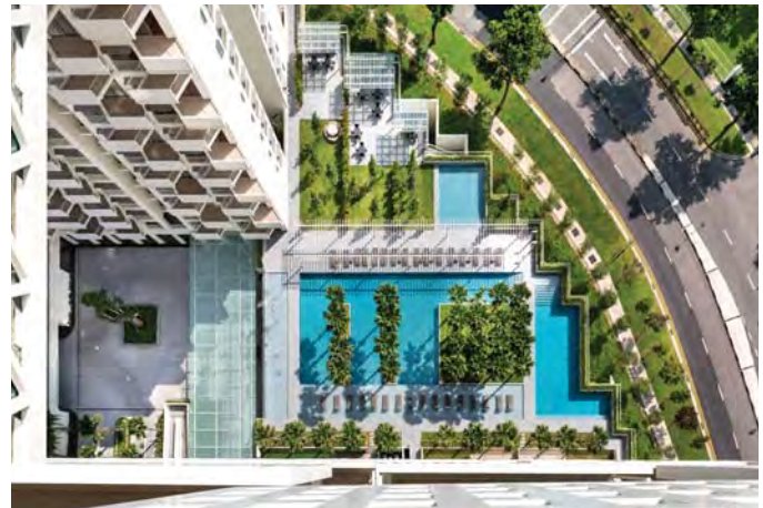
Figure 8. Swimming pools.

provides egress options, and makes all amenities accessible to both towers. The interconnections also provide more shared space to the tenants, reinforcing the concept of a vertical neighborhood.