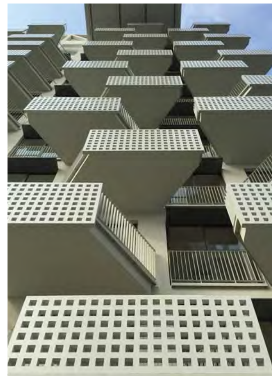
Figure 10. Cantilevered balconies, view from below. © Charu Kokate