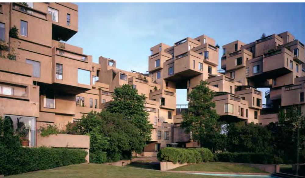
Figure 1. Habitat '67, Montreal.

A research-based examination of the housing typology that emerged from the original Habitat thesis has been ongoing for the past several years. The goal of the authors' firm has been to re-cast the original thesis, based on