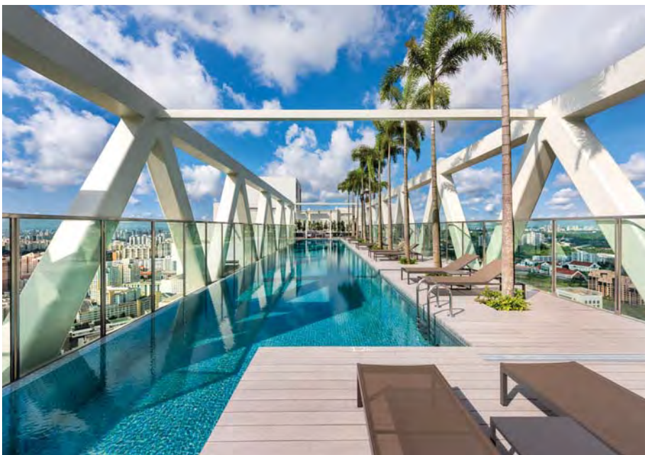
Figure 9. Rooftop bridge pool.

The façade design helps to mitigate the tropical heat. The cantilevered two-meter-deep balconies play a major role in shading the windows, and cut down on the direct solar radiation (see Figure 10). Each apartment is designed with a minimum of one balcony, and most units have either two or three balconies. Mounted to the face of