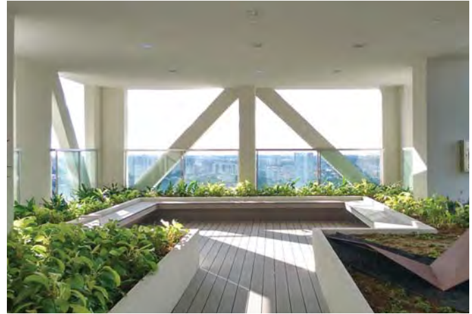
Figure 7. Typical communal space.