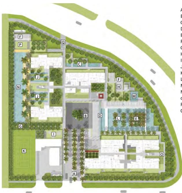
Figure 3. Site plan.

Each tower structure is composed of two seven-meter-wide bars, with a seven-meter-wide space in between. This minimizes the western façade exposure and avoids the tropical sun. As in the original Habitat project, building circulation is organized as a system of outdoor “streets” at each floor level. The openness of the building allows for natural air circulation and cross ventilation,