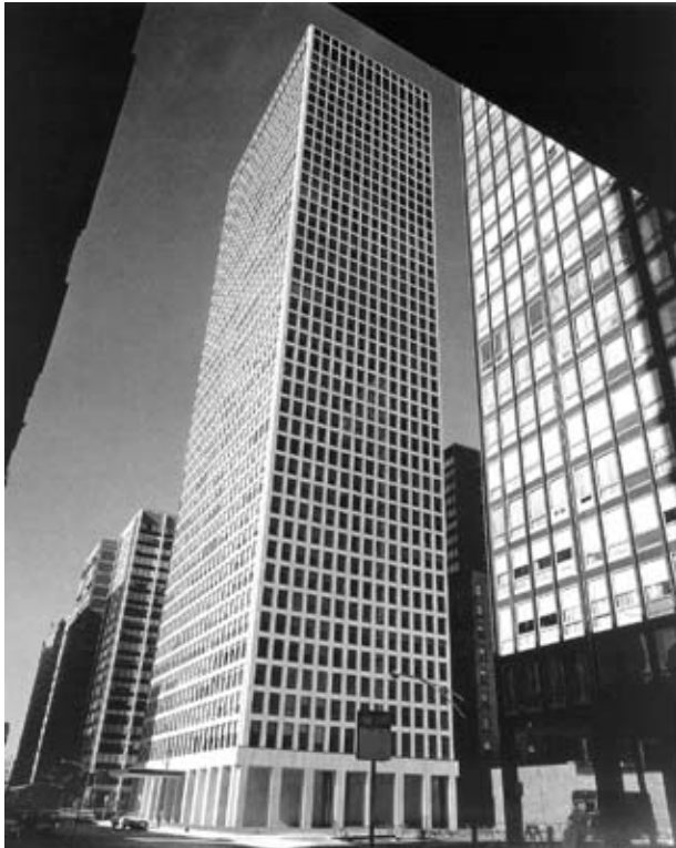
Figure 3: DeWitt-Chestnut Apartments, Chicago, 1963, Skidmore, Owings & Merrill.

Design teams of architects, planners, and engineers need to collaborate with clients to develop a vision for sustainable design. Ken Yeang and other architects are demonstrating that “bioclimatic” skyscrapers can be energy-efficient and related to their site and culture. These buildings often incorporate the same amenities that are found in the city including sky gardens within buildings that contribute to interior air quality by filtering pollutants.