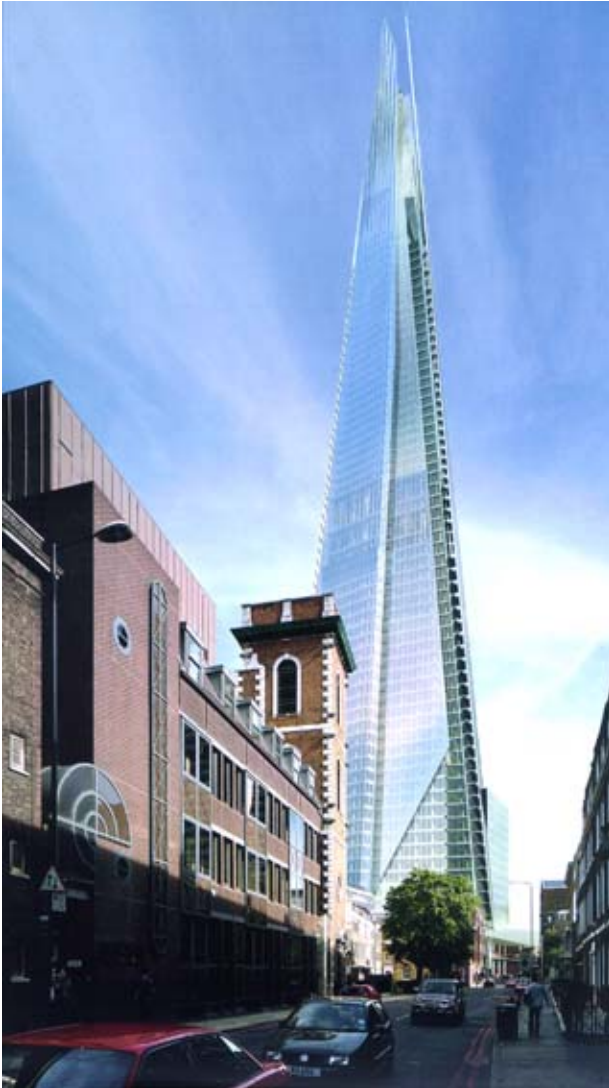
Figure 4: London Bridge Tower, London, 2009, Renzo Piano Building Workshop.

The London Bridge Tower proposed for 2009, designed by the Renzo Piano Building Workshop with Ove Arup & Partners, uses a floor structure that is a carefully integrated system of raised floors, slabs, tapered steel beams, and mechanical ventilation systems (Fig. 4). This reduces the floor-to-floor height to a very efficient 2.5