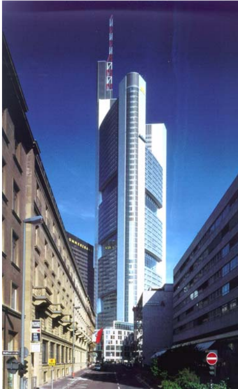
Figure 5: Commerzbank, Frankfurt am Main, Germany, 1997, Foster and Partners.

The Menara Mesiniaga in Subang, Malaysia, designed by T. R. Hemzah and Yeang in 1992, presents an early model building for the physical translation of ecological principles into high-rise architecture. The fifteen-story tower expresses its technological innovations on its exterior and uses as little energy as possible in the production and running of the building. Instead of a continuous facade, the building opens and closes in sections arranged in stages around the tower. It has an exterior load-bearing structure of steel with aluminum and glass,