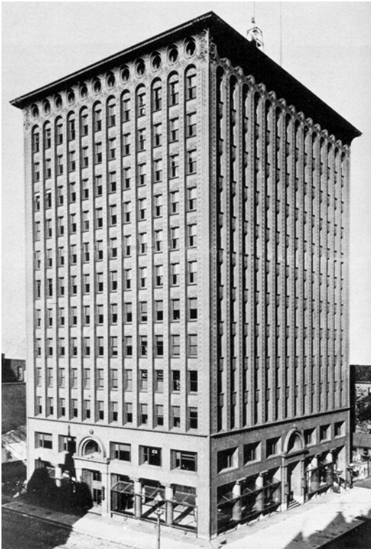
Figure 2: Guaranty Building, Buffalo, New York, 1895, Adler & Sullivan.

states and Canada by rail and barge, was especially fortuitous and made it one of the fastest growing cities in the world by the beginning of the twentieth century (Abel, 2003). As the city grew, so did its buildings, which grew at least as high as economics and current technology allowed.