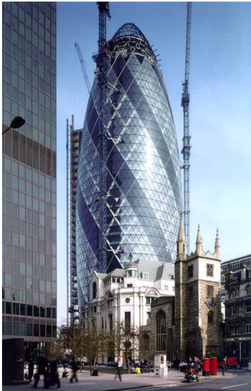
Figure 1: Swiss Reinsurance Headquarters, London, 2003, Foster and Partners.

as mega-structures and mega-buildings will need to be revised and allied with new building systems technology to meet the challenges of future sustainable tall buildings that are integrated with their urban habitats.