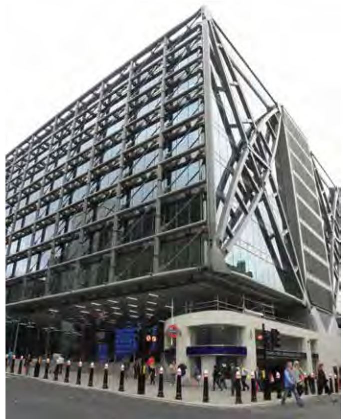
Figure 4. Cannon Street Station, London.

In the UK, technologically complex projects at London's Liverpool Street and Charing Cross stations completed in the 1980s and 90s significantly increased the value of the rail hubs and helped regenerate the respective areas. The overbuild at Cannon Street in 2011 exploited air rights to create a mixed-use development of offices and retail designed to unlock the commercial potential of the station and the surrounding area (see Figure 4). The dramatic steel megastructure spans and cantilevers the railway and Underground tracks. Within such scenarios, the station – in addition to being a transport node – becomes an attractive retail and commercial destination in its own right. Yet, while increasingly a common practice in other cities, the idea of high-density residential buildings constructed over rail lines is only just now taking hold in London.