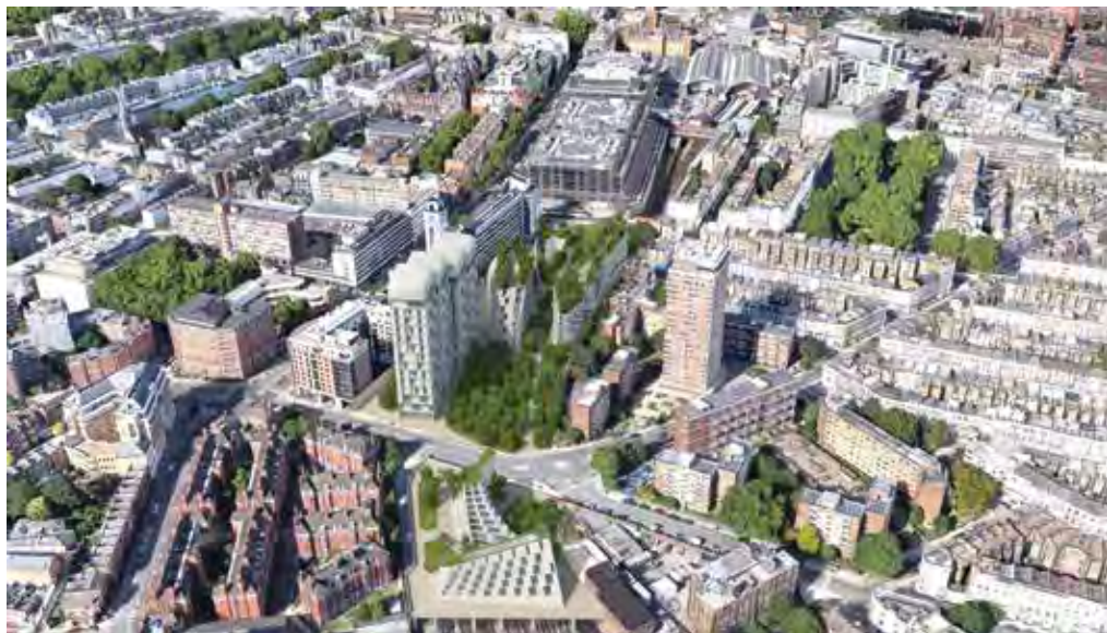
Figure 2. Victoria Station, London, with further decking, supporting a mixed-use development located over the approach tracks.

Given the ongoing concerns with tall buildings over 20 stories currently occupying London, particularly speculative residential developments (Pipe 2018, Weiss & Cook 2017), a conservative proposal might advocate overbuild schemes comprising 12-story developments that could equally be given over to residential or commercial purposes. These oversite developments could also form part of adjacent site developments (ASD) that create new communities, fuel economic growth and jobs, and generate revenue for both local authorities and land owners.