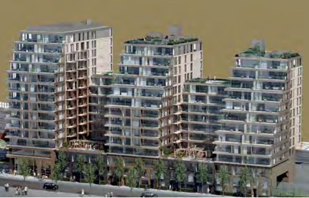
Figure 9. Royal Mint Gardens, London, is being built over three railway lines at different levels.