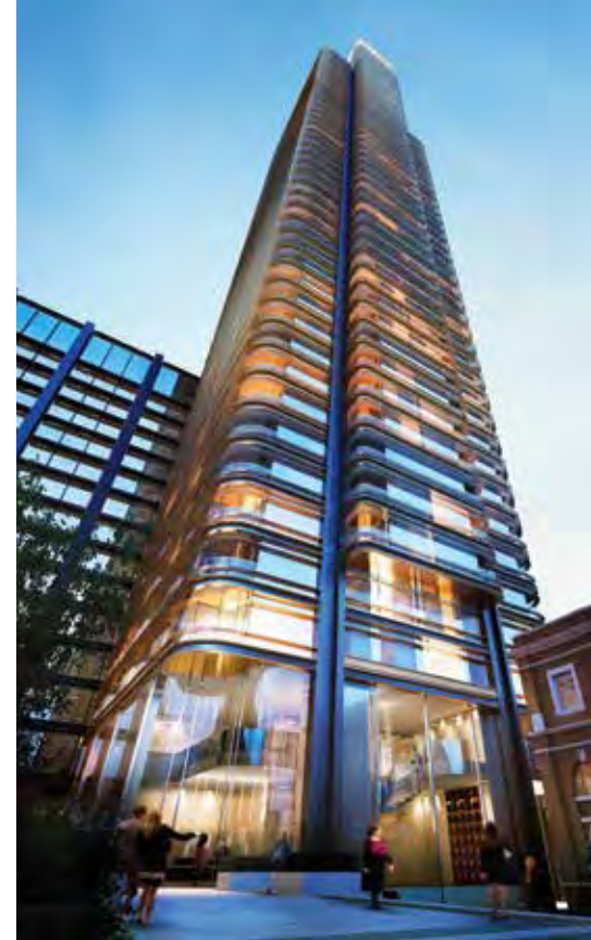
Figure 8. Principal Place, a two-tower project built over the railway approaches to Liverpool Street Station.

Comprising a mix of three- and nine-story blocks, Royal Mint Gardens provides 254 high-quality residential units and communal amenity spaces, articulated by new public spaces, communal roof terraces and courtyards (see Figures 9 and 10). The development maximizes the site's high- and low-level Docklands Light Rail (DLR) lines and cantilevers over viaducts of another rail line. Spaces within the viaducts are also utilized. Transfer structures were used to realize the project, while meeting the requisite vibration and noise isolation standards covering rail box containment and acoustically-isolated foundations.