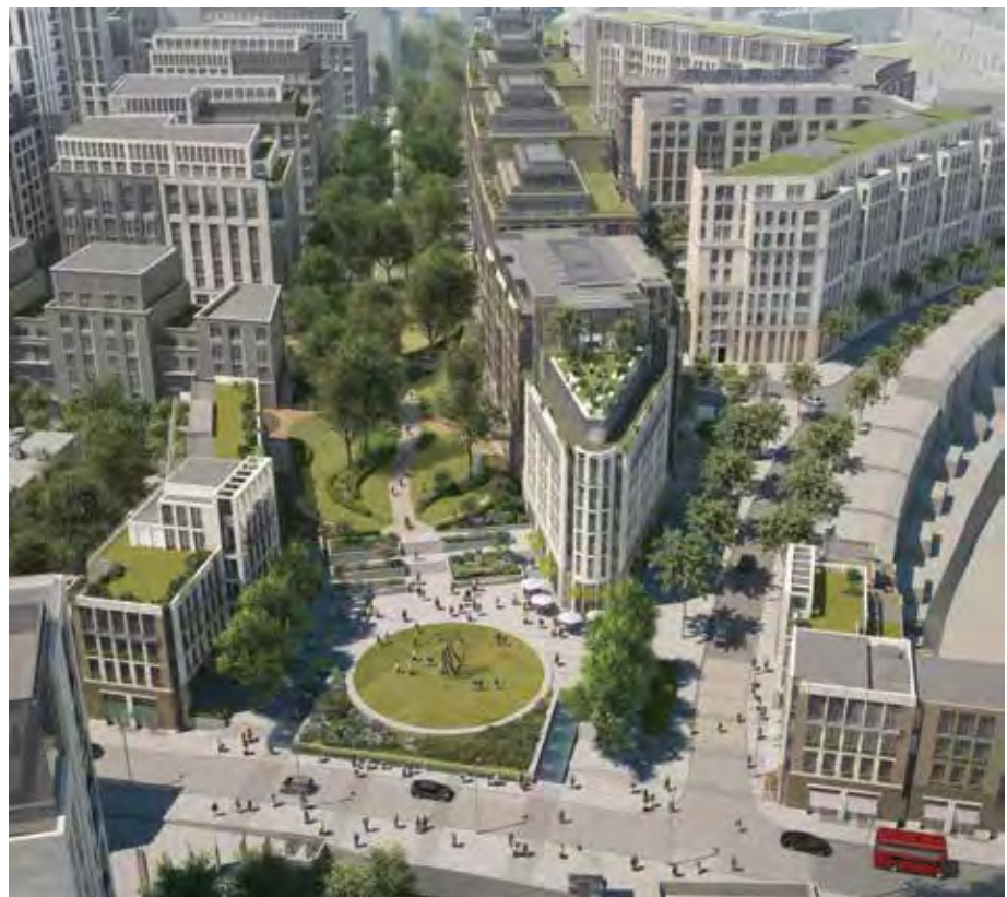
Figure 7. Rendering of the 32-hectare Earl's Court development in London, built over a rail junction. The scheme will include more than 6,700 homes by 2026.