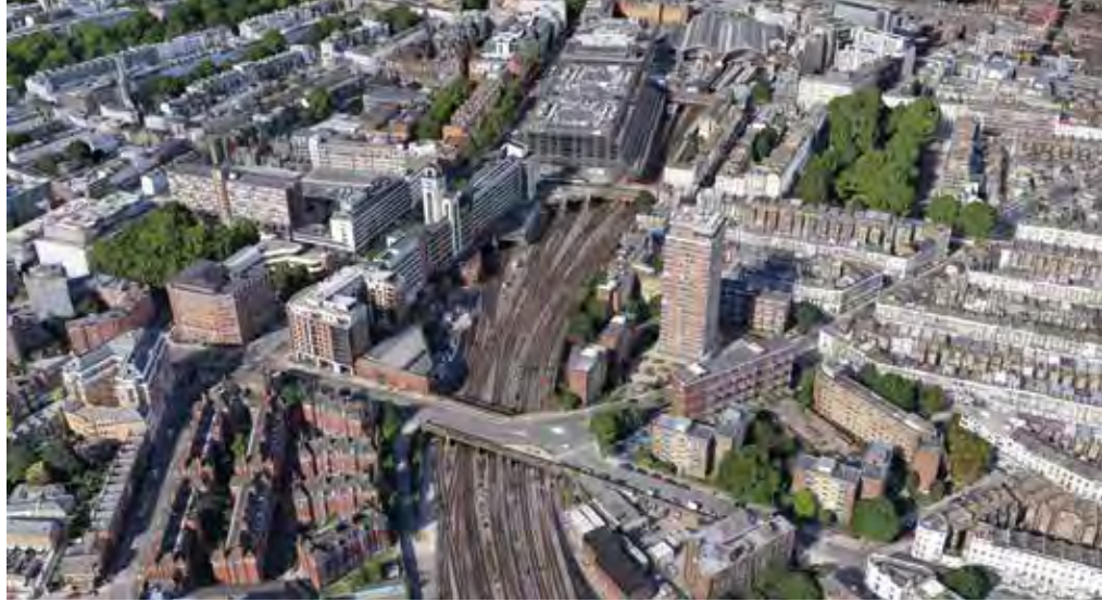
Figure 1. Victoria Station, London, with platforms already partially overbuilt with low-rise commercial development and a coach station.

Like many landlords, owners of railway land normally have air rights above their real estate, which gives them the opportunity, subject to planning policy considerations, to develop above the facility. This prospect may be sold or leased to other parties. Using air rights to create new developments above railway assets offers many benefits, especially as no new land is required. One is literally creating land "out of thin air," which can increase the availability of residential accommodation and help alleviate the current housing shortage.