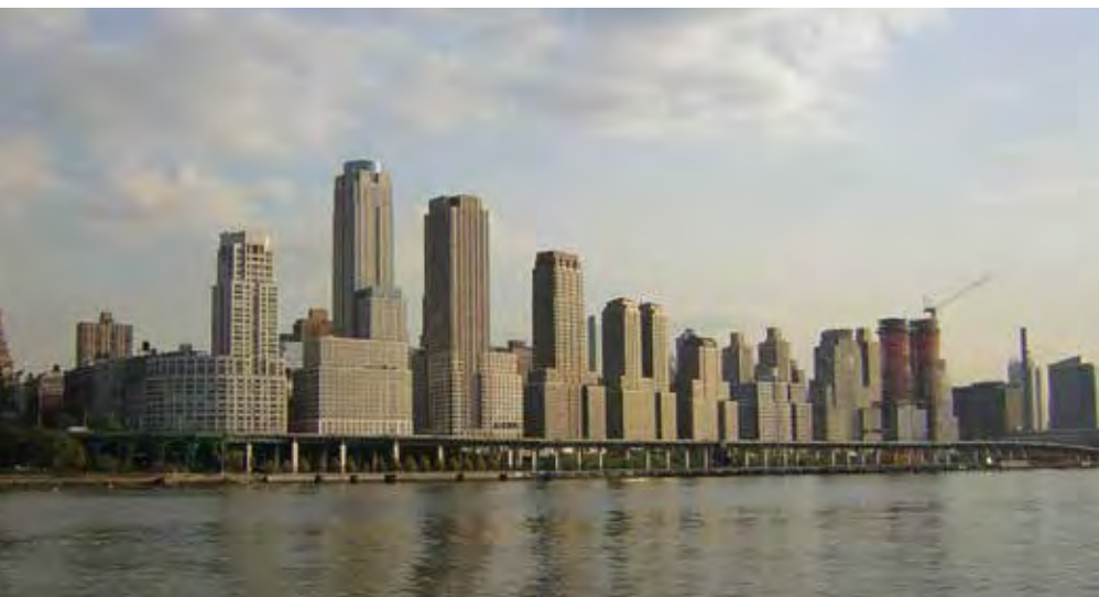
Figure 11. Riverside South, New York City, provides 5,700 apartments set on decks over a former rail yard.

quality of life and retain a skilled and valuable workforce, innovative actions must be taken to accommodate them. Railway overbuilds provide a strategy to build more environmentally sound, and inherently transit-oriented communities for our burgeoning cities. ■