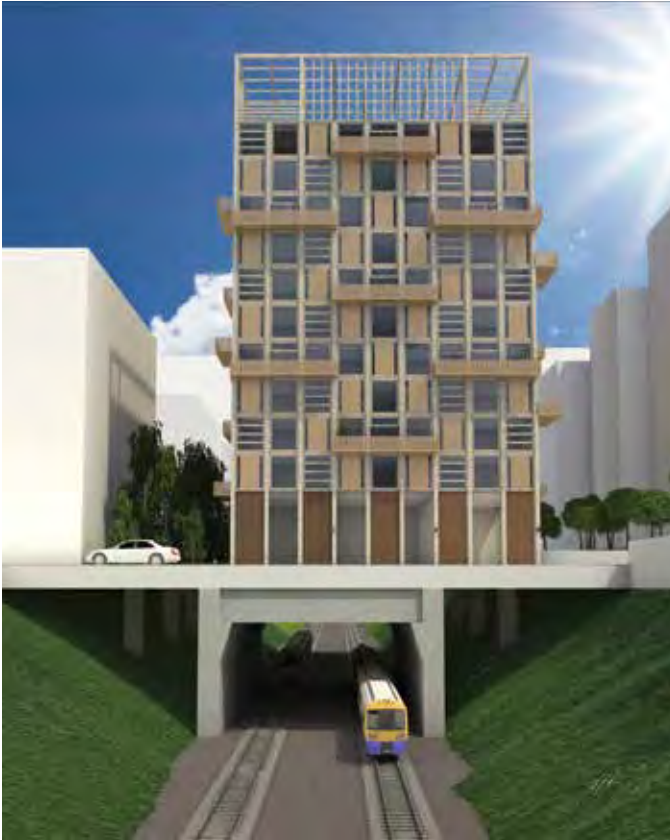
Figure 3. Schematic illustration of a 12-story flexible overbuild above rail tracks.