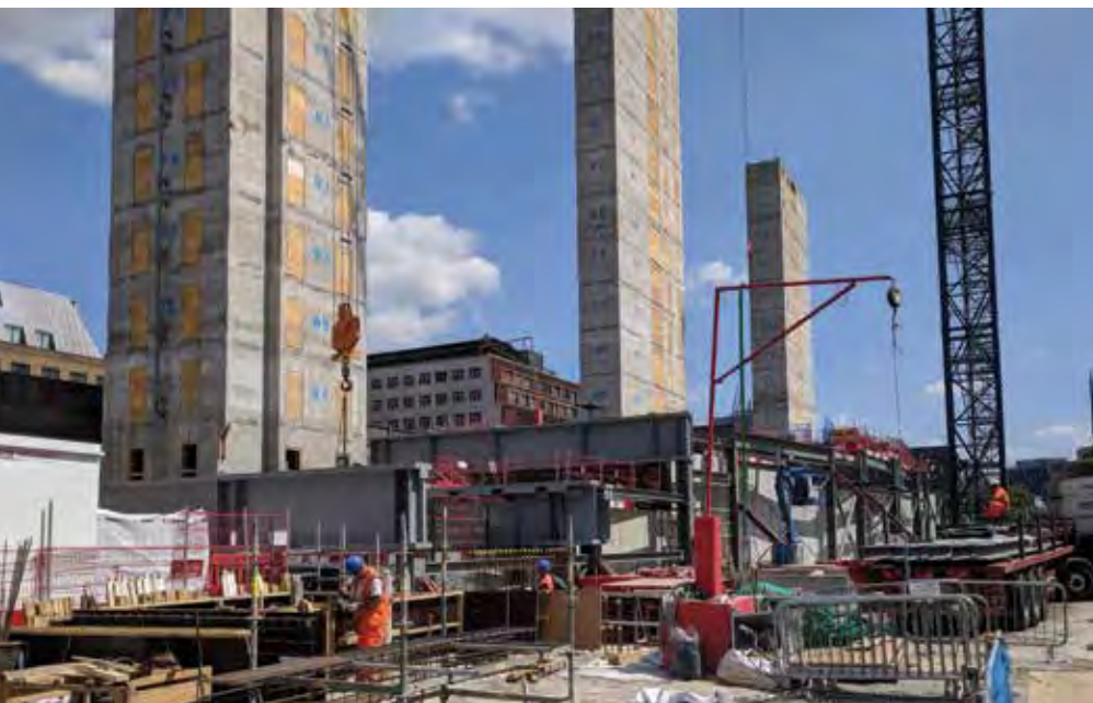
Figure 10. Royal Mint Gardens construction view. Steel beams bridge the structure over one of the rail lines on site.