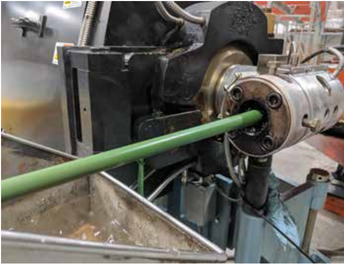
Figure 1. Plastic extrusion process.