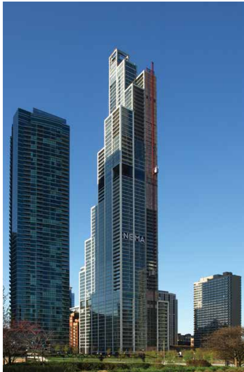
Figure 8. NEMA Chicago.

Additionally, a quicker construction schedule will reduce the number of days with noisy construction (noise emission). Residents in the surrounding ecosystem would not have as much disturbance due to the reduced construction activity. While there are the obvious political, social and economic pressures on constructing structures, we can attempt to protect the ecosystem and reduce the impact of the construction industry.