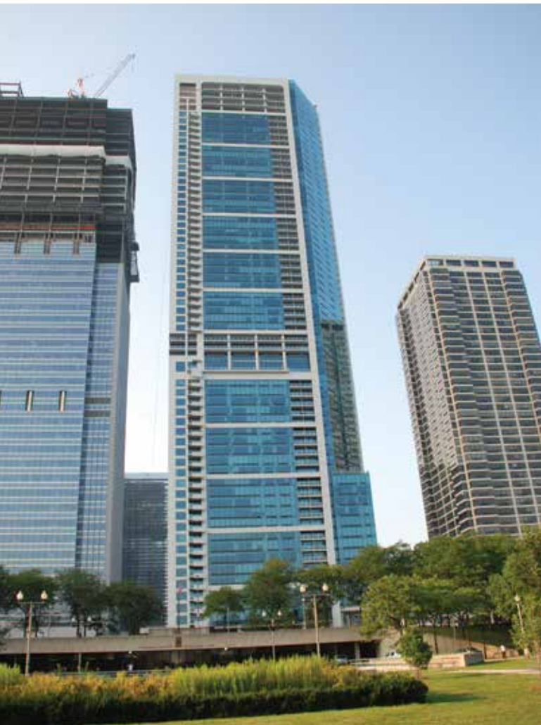
Figure 6. 340 on the Park, Chicago. © Neel Khosa

and volume can reduce HVAC costs within units. Operationally, there would be a reduction in the energy required to vertically transport liquids/gases or people.