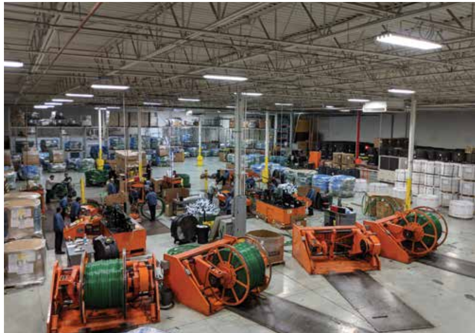
Figure 4. Unbonded PT manufacturing plant.

encapsulated (or watertight) anchorages (see Figure 2), at each end and at construction joints, which help to transfer the force to the concrete.