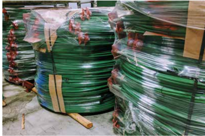
Figure 2. Unbonded PT bundle of tendons.