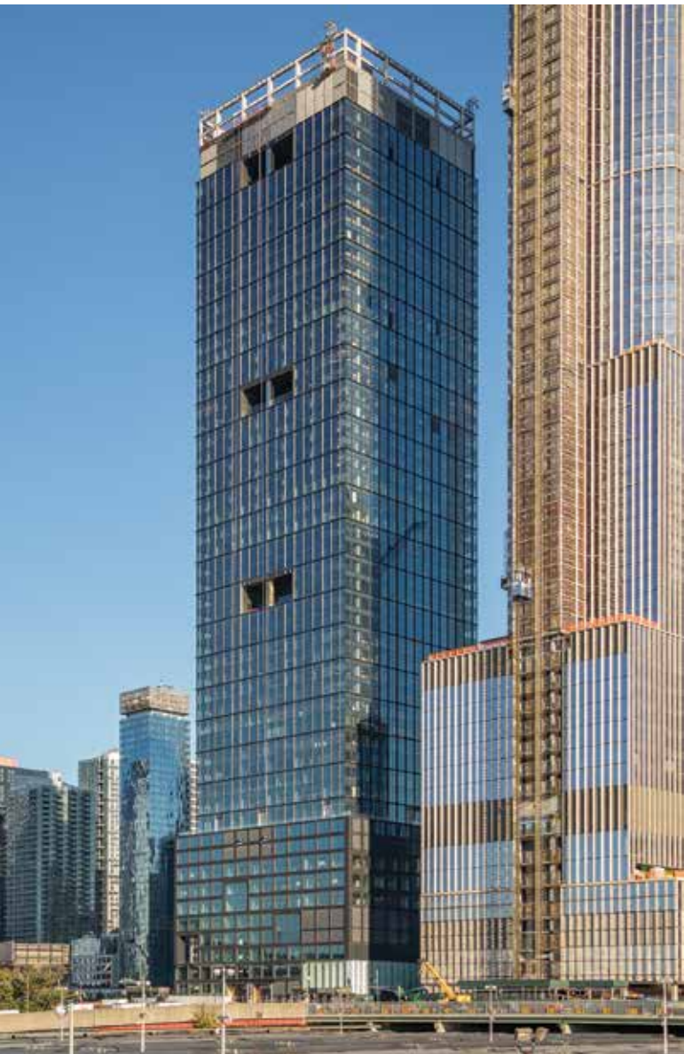
Figure 7. 55 Hudson Yards, New York.

10,000 square feet (929 square meters) in area. Escala had a floor plate of around 15,000 square feet (1,393 square meters) and utilized a low-shrink concrete mix to eliminate the need for a pour strip to control shrinkage cracks. The reduction in the number of pours helped the contractor stay on schedule.