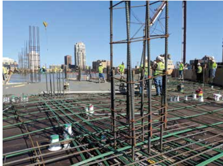
Figure 5. PT concrete pour.

Within buildings, unbonded PT is primarily used to reinforce horizontal or sloped concrete slabs, but it has been utilized in vertical wall applications. A typical PT flat-plate slab for residential applications is between seven and eight inches (177 and 203 millimeters) thick. Compared to a building with