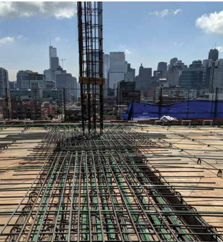
Figure 8. NEMA Chicago.

The structural engineer utilized outrigger links, 12,000-psi (83-MPa) lightweight concrete and unbonded PT to thin the slabs in order to reduce the dead load of the building. In total, 55HY had around 250 miles (402 kilometers) of unbonded PT tendons within the floors. The unbonded PT tendons were designed to leave “free areas” so that future stair openings could be added per tenant requirements. Accordingly, 55 Hudson Yards paved the way for other New York City skyscrapers that utilized unbonded PT, such as 1185 Broadway and the supertall 50 Hudson Yards.